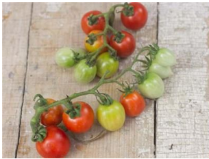
a Grappoli d'Inverno